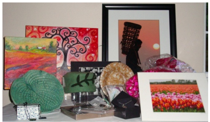
These are just a sampling of some of the beautiful items from local artists that were recently donated to THS for the silent auction.

Our first big fundraiser is just around the corner. We have been busy planning this exciting event that will take place on Friday, September 25. We have inserted a flyer with more information in this newsletter. Help us continue with the Society’s mission to preserve, promote, and interpret the rich and colorful history of Tualatin.