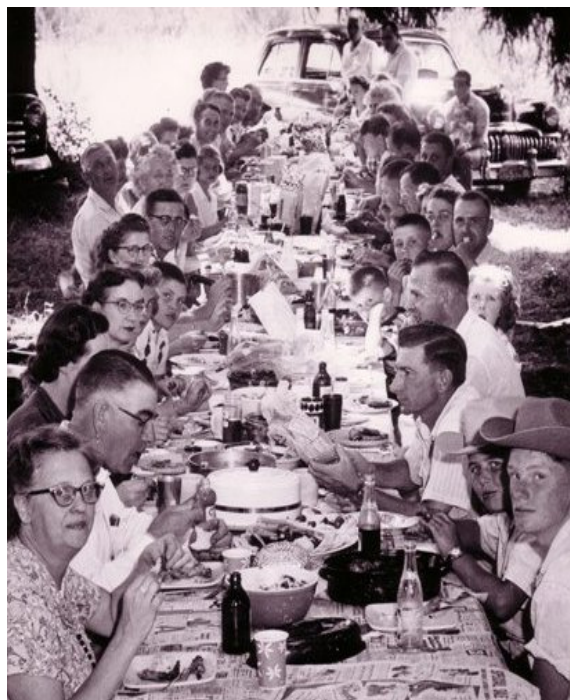
Picnic in the Park from long ago.