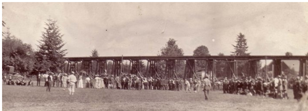
Tualatin's Original Park - The open area north of the Southern Pacific Railroad trestle was used as a park by 1916 and was a popular spot for July 4th celebrations. John L. Smith's enormous horse barn can be seen behind the trestle at right.