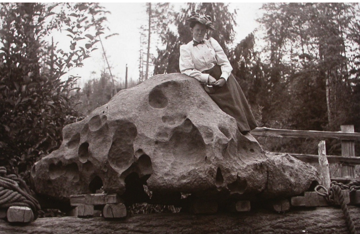
1905- Unidentified woman posing with the Willamette Meteorite.